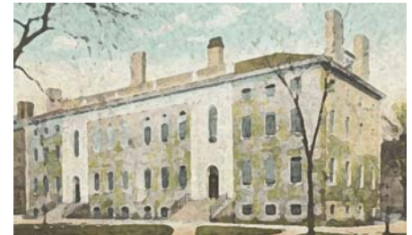
University Hall in 1880s

A student with an armload of books needs a handhold to pull the chair from the table, resulting in the unique "cut outs" that distinguish this chair from other college chairs. From the early 1900's replicas with the Harvard seal were sold by the Harvard Alumni Association to raise funds. Today Harvard authorizes only two manufacturers to handcraft these historic replicas. F.W. Lombard is exclusive maker of Harvard Business School open enrollment chairs, as well as the traditional chair with college and HBS seals. Learn more about the chair and the new Harvard-authorized "contemporary" design for those who prefer comfortable higher back support in an elegant college chair.